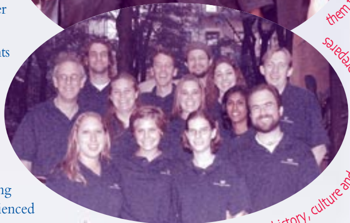
The in-depth teaching in Jewish history, culture and witnessing strategy prepares