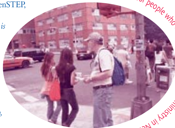
Step-in-a-Week is for people who can only spend a week of ministry in New York City.

The reality of the Word is hard to dismiss when you constantly walk in its shadow. There's a saying in Israel that "Every crevice tells a story" and I would add that each tells a story of God's faithfulness.