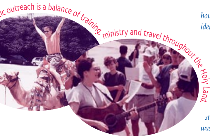
ec outreach is a balance of training ministry and travel throughout the Holy Land