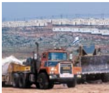
The start of a new Jewish settlement on the West Bank

of David and on the inhabitants of Jerusalem the Spirit of grace and supplication; then they will look on Me whom they pierced. Yes, they will mourn for Him as one