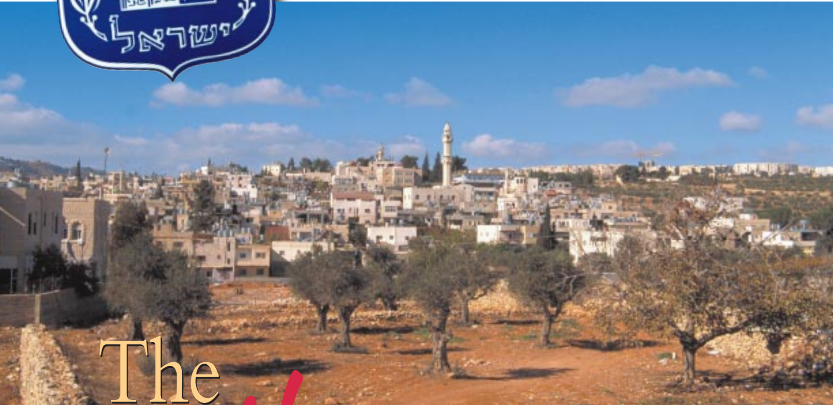
A view of Bethlehem on the West Bank

Please pray for our New York staff as we follow up on the many contacts we have gleaned through our ministry during STEP. We also need your prayers as we begin TeenSTEP. We will have more than a dozen teenagers sharing the Gospel in the subways, on the streets and in the parks of the greater New York area for the next week!