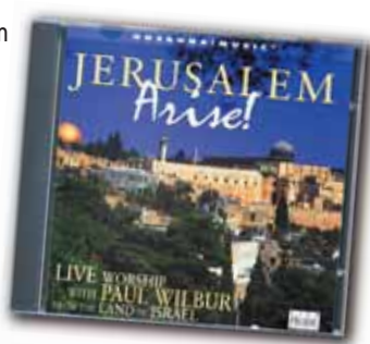
CD 4035 $18.95