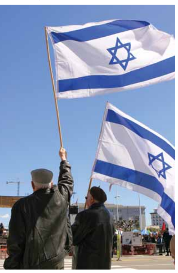
Israel will be the light to the nations that God intended her to be.