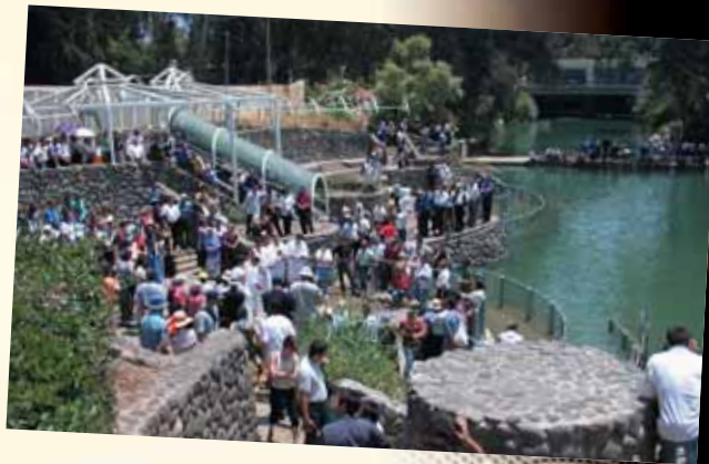
A baptism by our Tel Aviv congregation

I hope you will be as moved by the articles and testimonies in this newsletter as I have been. I want to do more to help our Israeli workers reach these dear folks—mostly Russian immigrants—who need so much help. We do want to feed them, help them “kick” their addictions, and care for their many physical needs, but