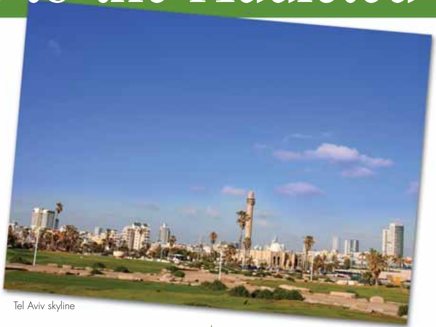
Tel Aviv skyline