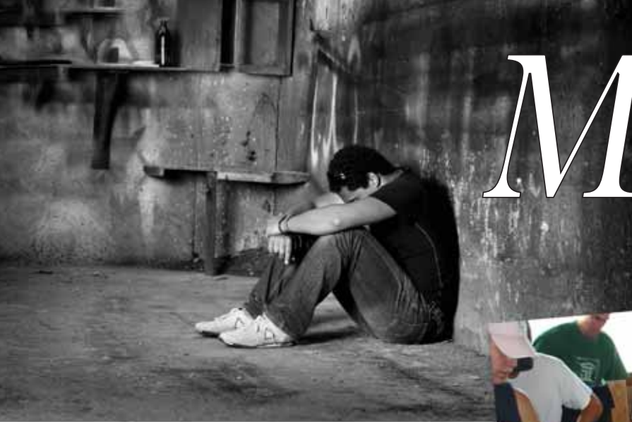
Chosen People Ministries staff and volunteers provide practical assistance through rehabilitation and outreach in Israel

There are many roads to the Lord's service, and very often a person's past experiences are transformed into mighty instruments of ministry. This is especially true in ministry to the addicted. It is a beautiful testimony of hope to see the life-changing power of Messiah in someone who was formerly enslaved but is now living a victorious life.