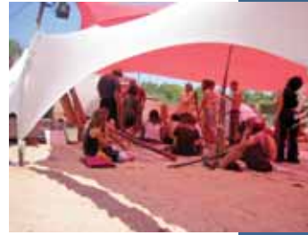
Photos from a recent evangelistic outreach at Shantipi, the annual New Age festival at the Sea of Galilee in northern Israel during Shavuot, the Feast of Weeks (Pentecost).