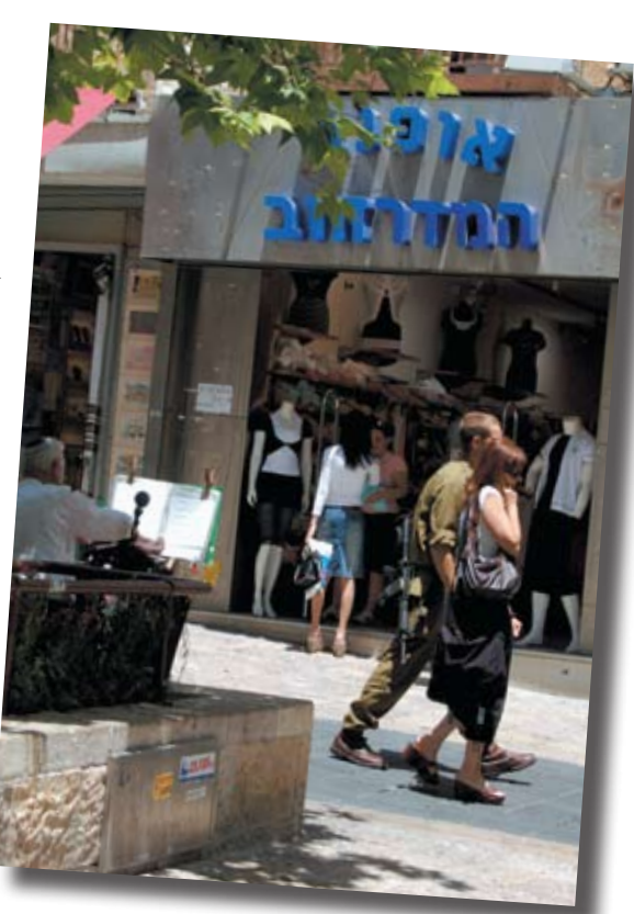
Tel Aviv is a city full of life.

There is no darkness that the light of Messiah cannot penetrate!