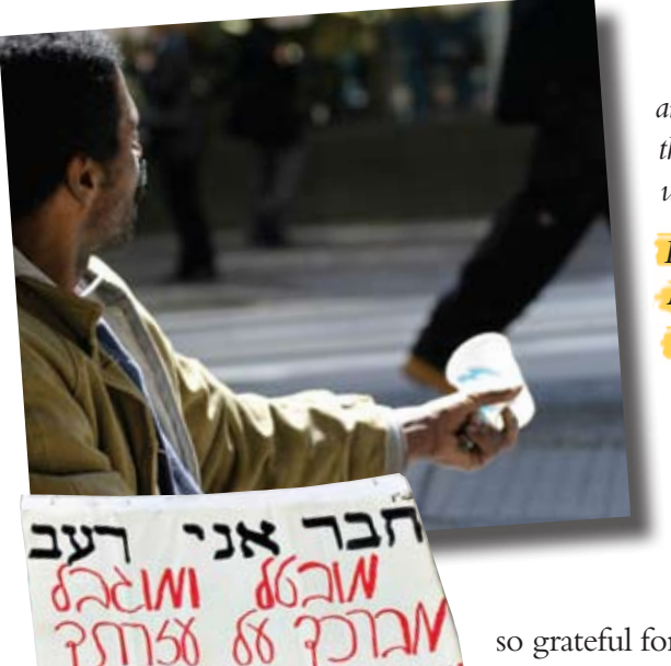
Our staff are serving the hopeless and homeless in Tel Aviv and sharing the love of the Messiah.

and support the new people who are at the first level. This system works well, unless the expenses of the first group exceed the earning power of the second—and that is what is currently happening. We do not receive any funding from the government.