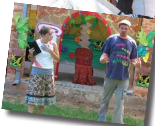
We are always ready for interesting conversations about the Lord.