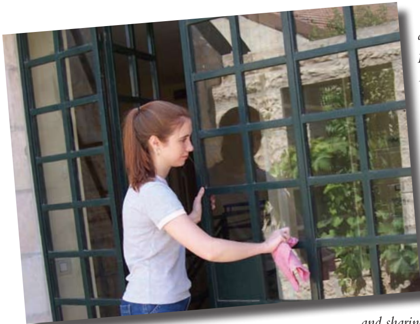
Our teams assist Israelis in practical ways.

about our group and was surprised to meet young people who would spend their vacation time serving people in Israel.