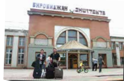
Ministry to Bukharan Jews - continued from page 4

It is our vision to establish a Messianic Center in Birobidzhan that would be a place of ministry to disabled, disadvantaged and homeless Jewish people, as well as a worship center for Jewish believers in Yeshua. We ask you to please pray for the ongoing ministry in Birobidzhan and the rest of the region.”