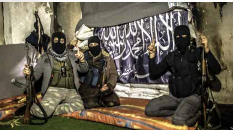
Al-Qaeda In Syria Photo