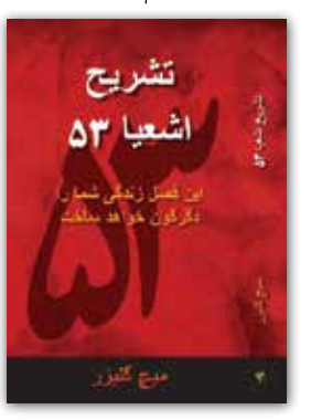
Isaiah 53 Explained in Farsi, the language of Iran

The question we naturally want to ask is this: "Is the current conflict between Israel and Iran a reflection of the spiritual battle between God and the devil as we draw closer to the end of this age?" It certainly seems so! Both Ephesians 6 and Daniel 10 pull back the curtains of heaven to show us that this earthly war reflects heavenly realities. The nations of the world, inspired by Satan himself, seek the destruction of God's chosen people in order to put a stop to the plan of God for the end of the age (Romans 11:11-19). This would elevate the Middle East conflict beyond the political and into the spiritual realm!