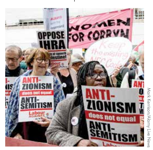
September 2018: Campaign in London on the day on which the Labor party NEC was expected to adopt the IHRA definition and examples of antisemitism.

the most critical reason of all. Antisemitism is the devil's invention! When God called Abram to be the father of His chosen people (Genesis 12:1-3), Satan made the Jewish people the target of his fury. The evil one has tried to annihilate the Jewish people in every age and in endless ways to prevent God from using us as His instruments of redemption through the Jewish Messiah. We know the devil will not prevail, although that does not prevent him from continuing to try.