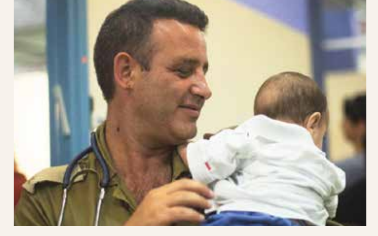
Operation Good Neighbor. Israeli Commander comforts a Syrian baby.

P.S. Our outreach to Jewish people in more than twenty North American cities and seventeen countries around the world is growing! We are so grateful for your prayers and support. For your gift of $125 or more, we would like to send you a beautiful commemorative medallion to remind you to pray for Chosen People Ministries in our 125th year, and beyond!