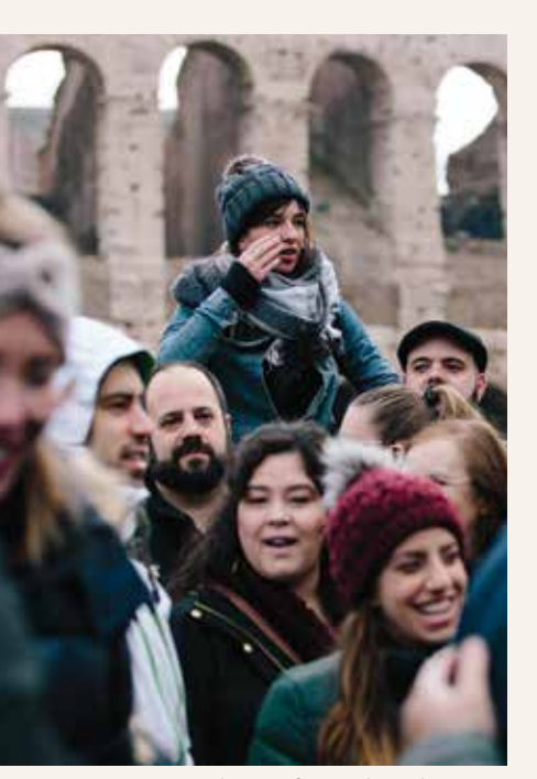
Our recent Muchan conference brought together young believers who are the future.

By God's grace we need to pray for this to change. And we need to take action to make sure that our fellow believers have a more balanced view of the conflict in Israel. Portraying Israelis as aggressors is unfair and untrue. This type of thinking only intensifies the conflict and pours cold water on the work of Jewish evangelism in Israel and around the globe.