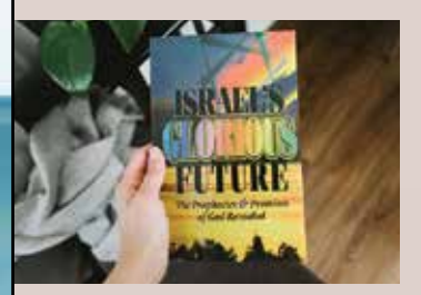
Israel's Glorious Future PRICE: $10.95<sup>US</sup>

As the nation of Israel continues to defend her people and borders, how can we know that Israel's future will indeed be glorious? By exploring the ancient prophecies, Israel's Glorious Future reveals the faithfulness of God to the everlasting covenants.