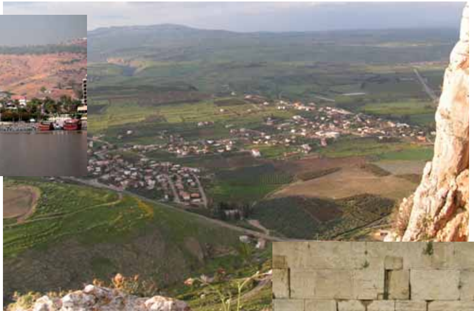
Louise Derr ©2007