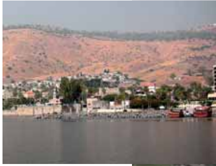
Kelly Coleman ©2006

The recent discussion in most major news magazines regarding the