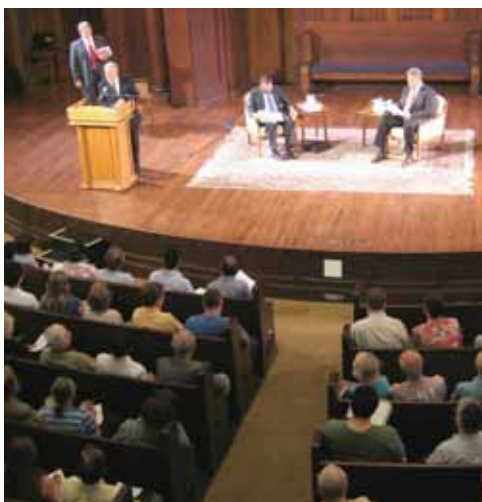
Programs designed to attract Jewish seekers—like this live debate in June—are held at strategically-located venues.

Jewish life in America is changing, and nowhere is this more greatly reflected than in the New York area. The earlier Jewish immigrants from Eastern Europe who landed in New York City once numbered about two million. As they gained a firm