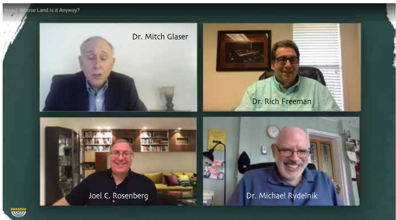
Our “Israel: Whose Land is it Anyway?” online conference August 15, 2020.

So, let me tell you what we need so that you can pray about giving to Your Mission to the Jewish People.