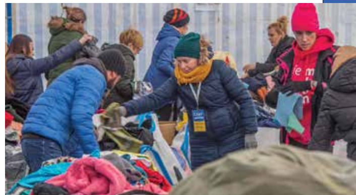
Your Mission to the Jewish People, pictured here assisting Ukrainian refugees in Poland, is actively ministering to the less fortunate.

Now, as we consider this passage in Micah regarding ministering to the less fortunate, please keep the leadership and people of Ukraine in your prayers.