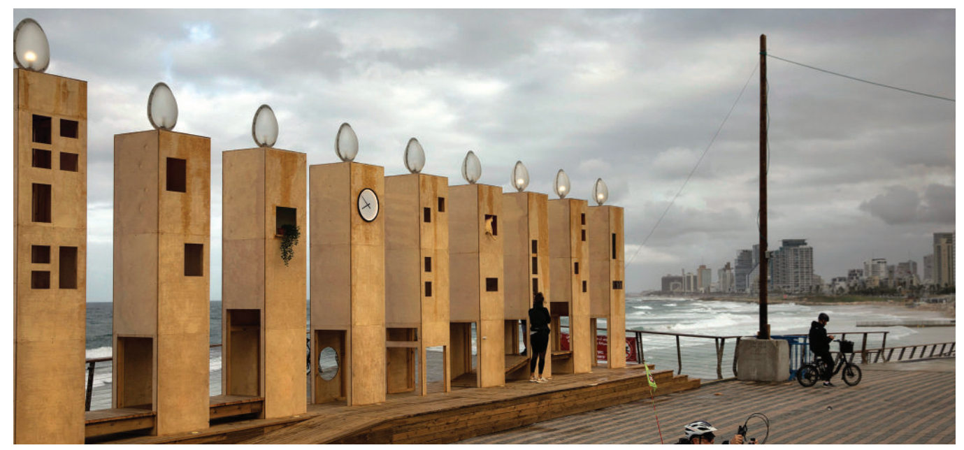
People visit a giant menorah in Tel Aviv, Israel, during the Jewish holiday of Hanukkah - December 1, 2021.

Another critical passage revealing God's heart for the Jewish people is Romans 1:16: "For I am not ashamed