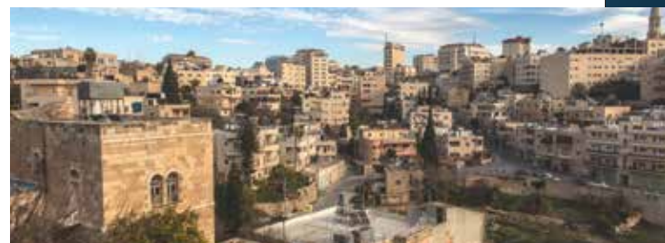
The modern city of Bethlehem.

Micah wrote in 5:4, this messianic king "will arise and shepherd [God's] flock [Israel] in the strength of the Lord" and in His "majesty," which is certainly in harmony with His character. Contrast this glorious future with the failure of Israel's leaders in Micah's day. Earlier, Micah had rebuked Israel's leaders (Mic 3:1–3), claiming they do not know justice and "hate good and love evil." The pastoral role of Israel's messianic king who leads and cares for His people is in view in Mic 5:4. His greatness ultimately will guarantee their security.