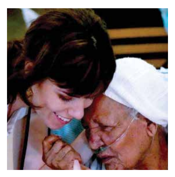
SINCE OCTOBER 7, WE HAVE BEEN MINISTERING TO ISRAELI REFUGEES.

Though I grew up in a secular, atheistic Jewish family, God showed Himself to me in a special way. He had to get hold of my intellect before He captured my heart. One of my teachers in high school was a Messianic Jewish believer. He did not make a big deal about it, but I remember one of the students pressing him about what he believed one day, and he said, "Yes, I'm a Messianic Jew; I believe in Jesus." Later, I dated a guy who also said he was a Jewish follower of Jesus. We had lots of theological arguments.