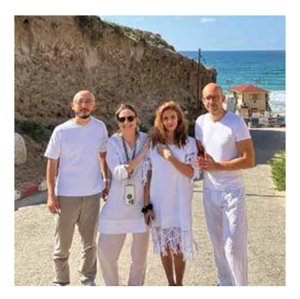
WE BAPTIZED ONE YOUNG WOMAN WHO BECAME A BELIEVER WITHIN A WEEK OF THE ATTACK.

I never tire of hearing the stories of others, both Jewish and Gentile, who have been transformed by the power of God. Helping Jewish people find eternal life through the Jewish Messiah remains the focus of Chosen People Ministries as it has from the very beginning of our ministry 130 years ago.