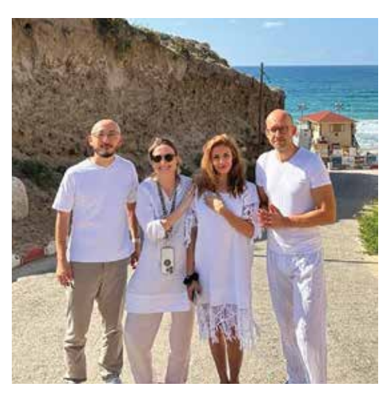
WE BAPTIZED ONE YOUNG WOMAN WHO BECAME A BELIEVER WITHIN A WEEK OF THE ATTACK.

I never tire of hearing the stories of others, both Jewish and Gentile, who have been transformed by the power of God. Helping Jewish people find eternal life through the Jewish Messiah remains the focus of Chosen People Ministries as it has from the very beginning of our ministry 130 years ago.