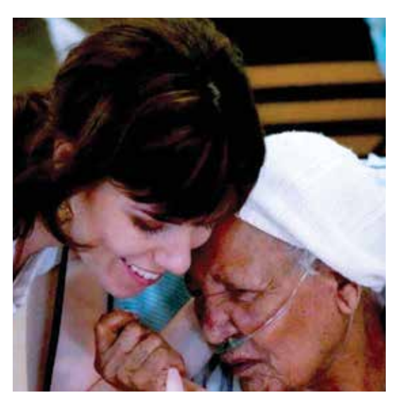
SINCE OCTOBER 7, WE HAVE BEEN MINISTERING TO ISRAELI REFUGEES.

Though I grew up in a secular, atheistic Jewish family, God showed Himself to me in a special way. He had to get hold of my intellect before He captured my heart. One of my teachers in high school was a Messianic Jewish believer. He did not make a big deal about it, but I remember one of the students pressing him about what he believed one day, and he said, "Yes, I'm a Messianic Jew; I believe in Jesus." Later, I dated a guy who also said he was a Jewish follower of Jesus. We had lots of theological arguments.