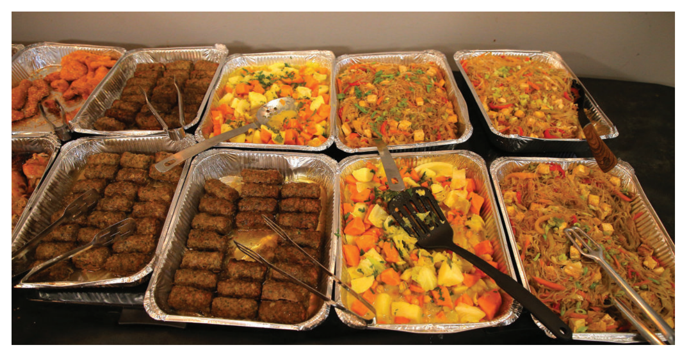
The most meaningful aid we provided was fresh, home-cooked food for soldiers.

The commander kept shaking my hand, and he said, "You have no idea how much this means to our soldiers. Yes, we have food, but it's tuna fish in a can." Home cooking means so much for the soldiers. Everyone was really grateful, and we took time to pray.