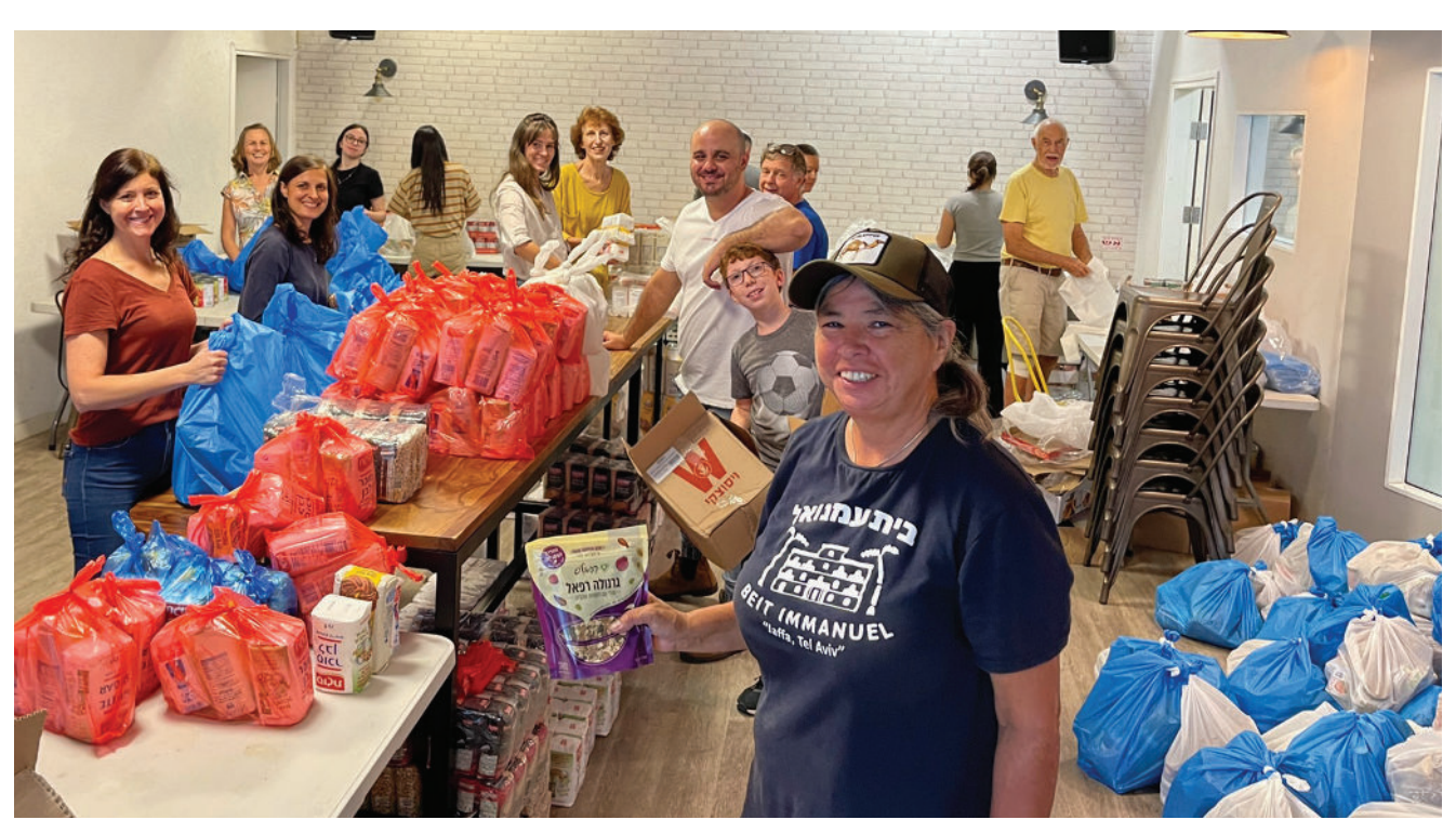
Making care packages for Israeli evacuees

I write this letter after conversations with social workers from different hotels, each housing