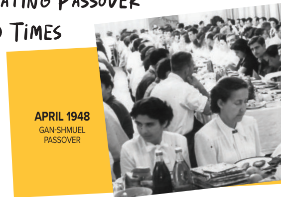
APRIL 1948 GAN-SHMUEL PASSOVER

But the most memorable words were: “Next year in Jerusalem!” It was difficult for me, as a Soviet soldier, to dream about Jerusalem or Israel at that time. But these words entered my heart so deeply that for many years, though I never fully celebrated Passover again, every year during that time, I said to myself, “Next year in Jerusalem.” I didn’t believe that I would ever see Jerusalem, but in 1990, I was able to leave for Israel, and I have been living in this beautiful country for more than thirty years. For me,