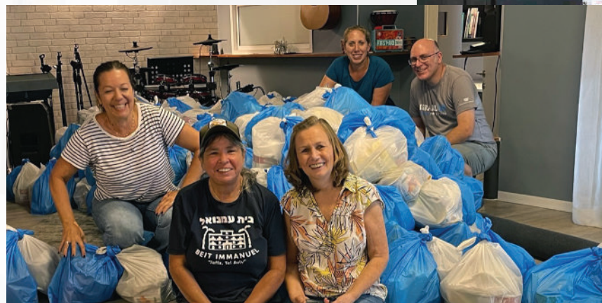
Our staff and some volunteers at the Tel Aviv Messianic Center

We pray Israelis will increasingly use our network, hear the gospel, and come to faith in Messiah.