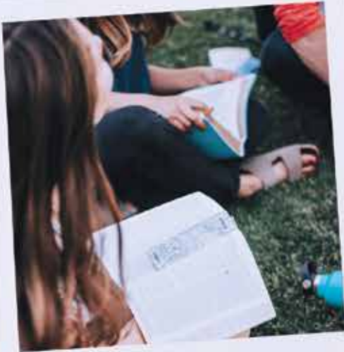
READ THE BIBLE