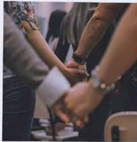
PRAY & INTERCEDE