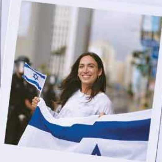
BLESS & SUPPORT